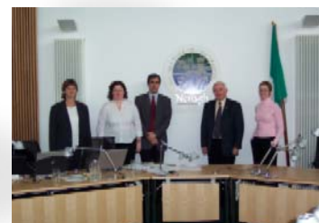
Audit – November 2005